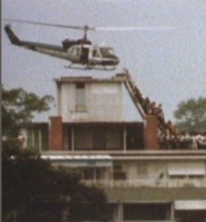
"There's going to be no circumstance where you see people being lifted off the roof of an embassy." - President Biden, July 8, 2021